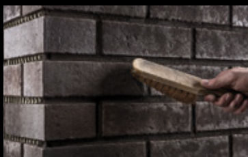
Sweeping out the joint gives it a corresponding structure.