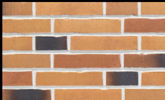
391 ockererz Δ < 3 % · DIN EN 14411, Gr. AII 0