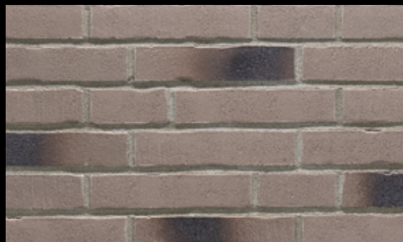
393 eisenasche Δ < 3 % · DIN EN 14411, Gr. AII 0