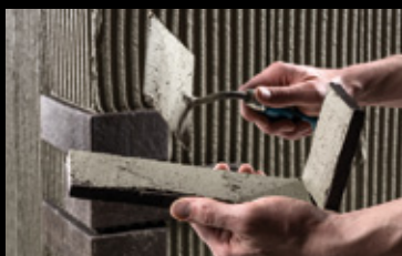
The corner angles are worked using the floating-buttering method.