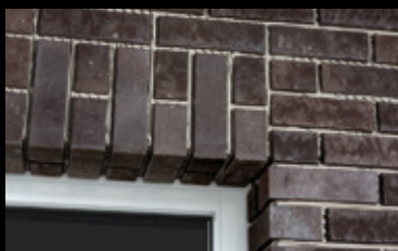
Window lintel perfectly replicated with angles.

JOINTING: After applying the clinker slips and after a corresponding drying time (see the adhesive manufacturer's instructions), a start can be made on grouting. Clinker slips with smooth surfaces can be processed by the slurry method. There are a number of grouts on the market but some have plastic and pigment additives. For this reason, you should always consult the mortar manufacturer regarding suitability before choosing the grout. All rough, patinated and textured surfaces are grouted with a conventional pointing trowel and a metal float.