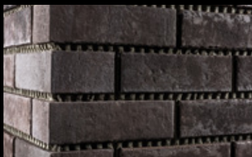
The finished surface. Grouting can be done after the appropriate drying time.