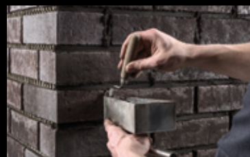
The vertical joints can be finished more easily with a smaller pointing trowel.