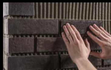
Use a string to plumb the clinker area. The clinker slips are pressed into the adhesive bed.