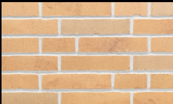
390 champagnersalz Δ < 3 % · DIN EN 14411, Gr. AII 0