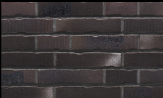
394 schwarzkreide Δ < 6 % · DIN EN 14411, Gr. AII 0 - Part 1