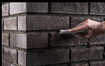
Jointing with a trowel allows you to create different looks.