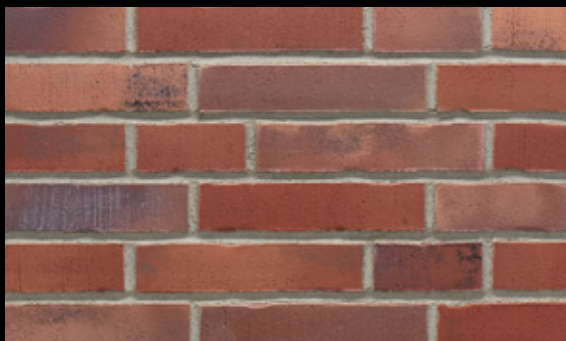
392 rotrost Δ < 3 % · DIN EN 14411, Gr. AII 0