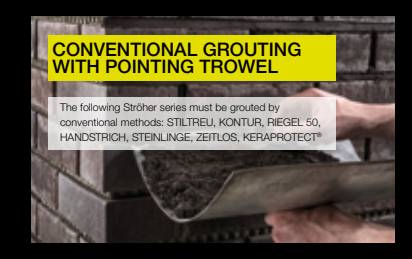
Grouting using pointing trowel and metal float along the horizontal.