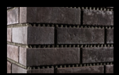
The finished surface. Grouting can be done after the appropriate drying time.