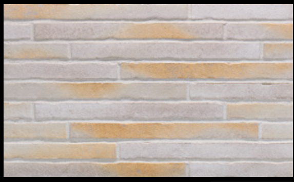
450 golden-white ♦ < 6 % · DIN EN 14411, Gr. All subset