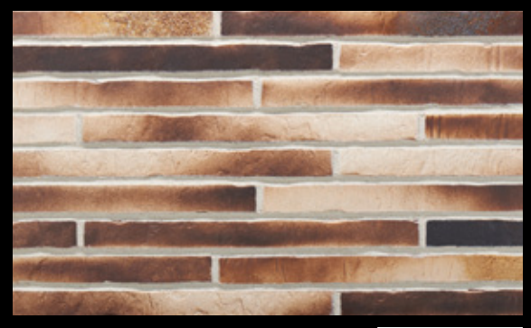
451 golden-brown ♦ < 3 % · DIN EN 14411, Gr. Al<sub>e</sub>