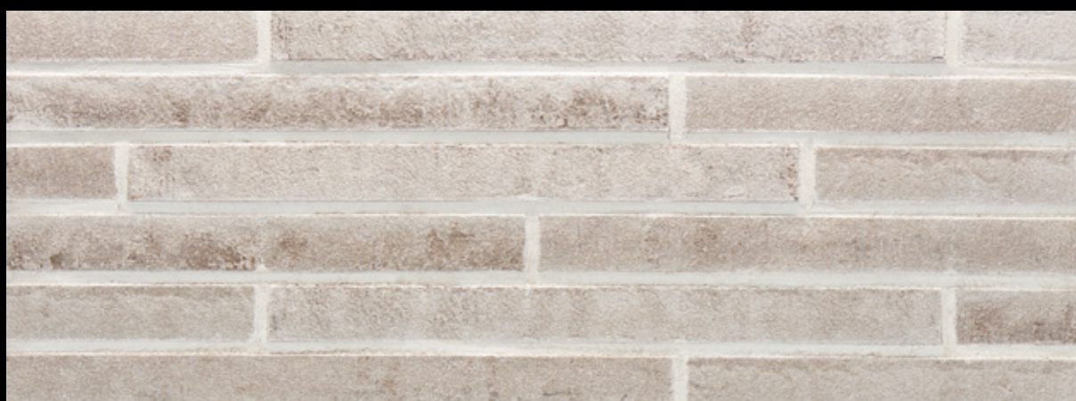
452 silver-grey used look