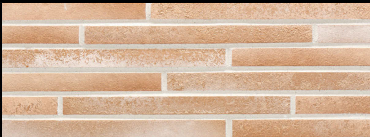
454 creme-white used look